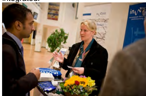
Participant at an exhibition booth at IDRC Davos 2008.

GRF Davos offers over 300 square meters of exhibition space in the Congress Centre during the IDRC Davos 2010. Exhibition space for companies and organisations is available for CHF 500 / m 2 . Minimum size of the booth is 6m 2 . In order to maximise the time participants spend in the exhibition area refreshment points have been integrated.