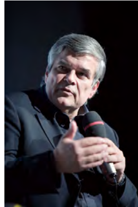
Ulrich Tilgner, Tehran, Near and Middle east Expert, Special Correspondent for TV channels, moderating the Plenary session on “terrorism and Human Security” at IDRC Davos 2006