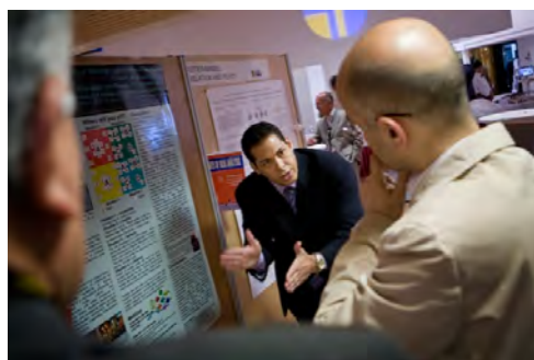
Lively discussion at the Poster exhibition at IDRC Davos 2008

During the IDRC Davos 2010 there will be Catering points integrated in the poster area. By sponsoring this catering points your company gets the opportunity to make the name visible to a huge audience.