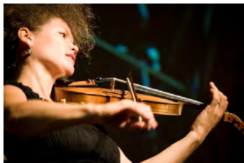
Musical Entertainment at IDRC Davos 2008.

We will properly inaugurate the conference with high-level-speeches and a musical entertainment programme, in order to launch a successful congress.