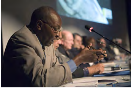
African Delegation at IDRC Davos 2006: Plenary session on „Risk Reduction Needs in the African Sub-Saharan Region”.