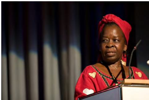
Hon. Maria Mutagamba, Minister of Water and Environment, Kampala, Uganda at Plenary Session on “ Integral Risk Management-Key for successful Risk reduction” at IDRC Davos 2008.