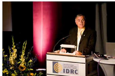
Hans-Peter Michel, Mayor of Davos welcoming the audience at IDRC Davos 2008.